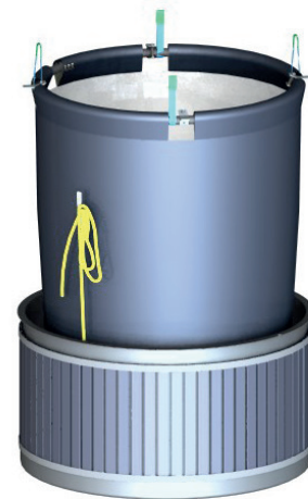
Lifting stage 1

NOTE! There are short emptying instructions and illustrated locking instructions on the side of the lifting bag.